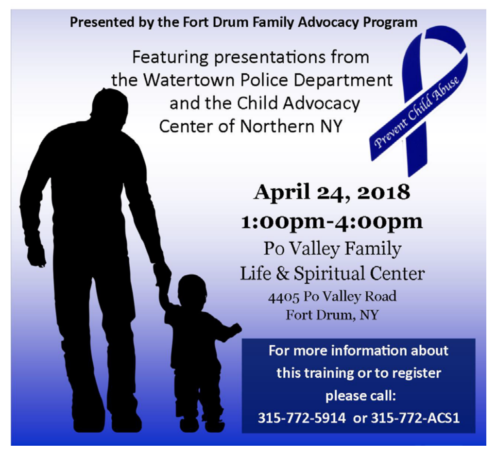
Fort Drum - Home of America's Light Infantry Division

A training on child abuse indicators and prevention