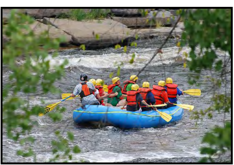
Whitewater Rafting in the Black River