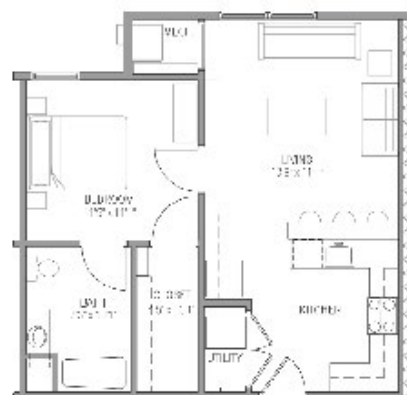
One Bedroom 686 Sqft