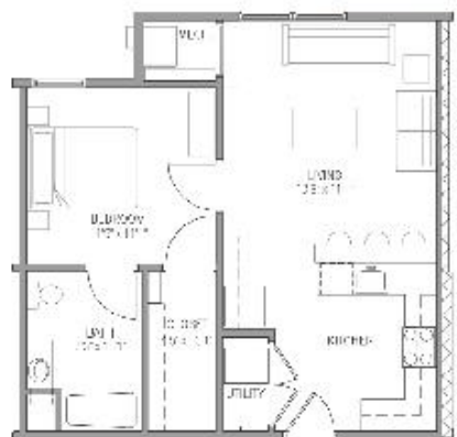
One Bedroom 686 Sqft