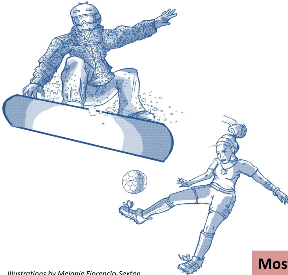
Illustrations by Melanie Florencio-Sexton