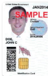
Common Access Card