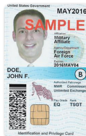
Common Access Card

Active Military Foreign Affiliate Eligible only with this ID (no other ID accepted)