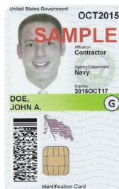
Common Access Card

Active Military Foreign Affiliate Eligible only with this ID (no other ID accepted)