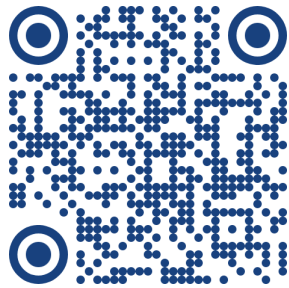
South Riva Ridge Child Development Center