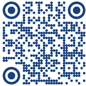
CYS Administration – North Riva Ridge