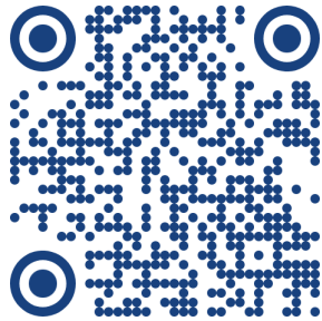
Po Valley Child Development Center