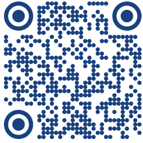
Chapel Child Development Center