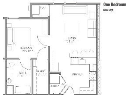
One Bedroom 686 Sqft